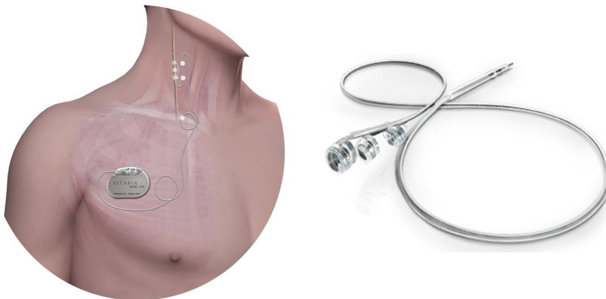
Figure 1. The VITARIA autonomic regulation therapy (ART) system implanted on the right cervical vagus nerve (left), which includes the VITARIA Model 7304 lead (right).

this study, we provide findings of a survival analysis, performed to evaluate the long-term performance of the Model 304 PerenniaFLEX lead.